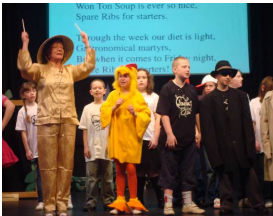
Rothesay Primary School present the Pantomime Jack the Musical. Rothesay Academy School Band, underlining the benefits of a 3-18 Joint Campus, accompanied the cast.

The Christmas Pantomime, Jack, celebrated the exceptional talent of staff and pupils. This production was based on teamwork and engagement with the local community. The Primary 7 Talent Show and Deal or No Deal evening, run by the PTA, was an enjoyable family event. Annual events such as our Hallowe'en and Valentine discos were a great success and thoroughly enjoyed by all who attended. Our end of session whole school concert celebrated Scottish culture in our Homecoming Year – another success, which was enjoyed by everyone.